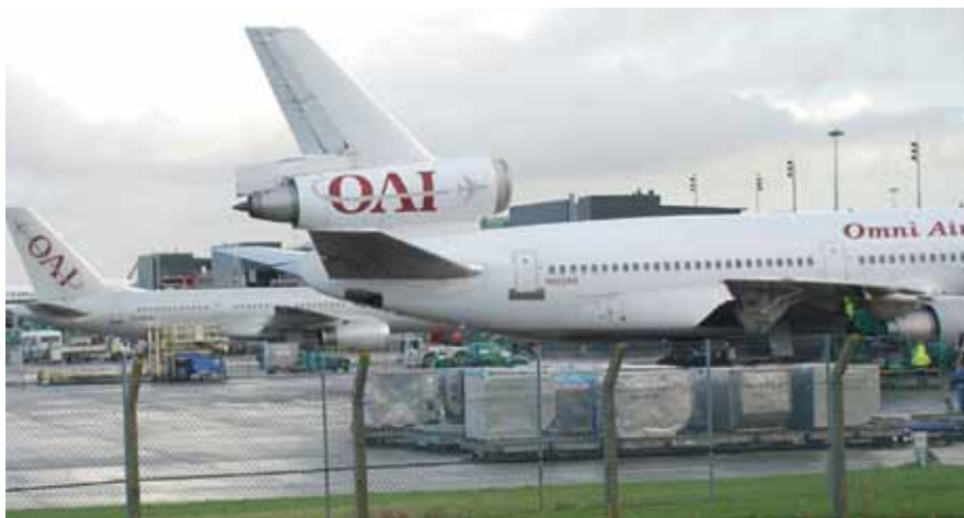
Omni Air International is the main carrier of US troops through Shannon Airport

In addition to Shannon's participation in these illegal and unnecessary wars, successive Irish governments have failed to live up to their human rights obligations by failing to monitor or inspect suspect rendition aircraft passing through Shannon. The Irish Human Rights Commission, Amnesty International and others have called for a range of measures to address this, including the provision of detailed information about a flight before it lands on Irish soil. There have also been calls for legislation to ensure that any aircraft alleged to be involved in rendition cannot leave the State before an inspection is carried out.