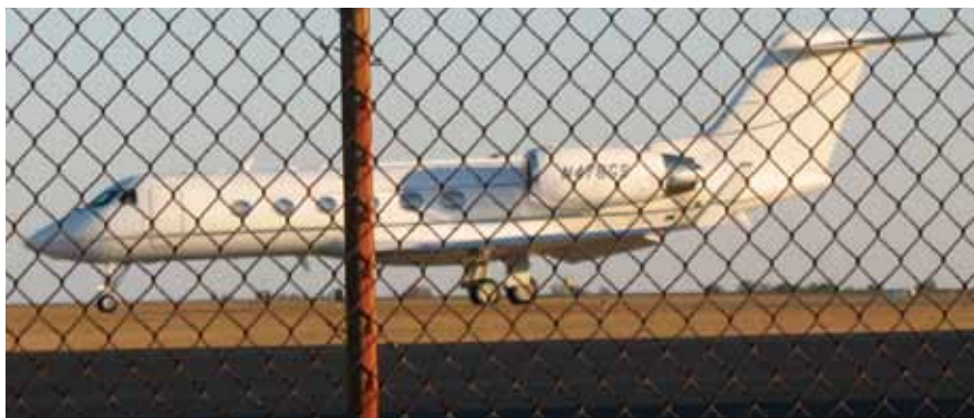
Suspect rendition aircraft N478GS which has stopped at Shannon many times.

According to Article 1 of the Chicago Convention, every State has complete and exclusive sovereignty over the airspace above its territory. Article 5 allows civil aircraft such as those not operating regular, scheduled services to fly over other States or to